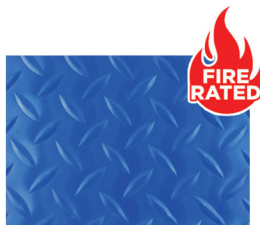
FLAME RETARDANT DIAMOND