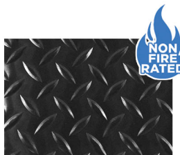
NON-FLAME RETARDANT DIAMOND