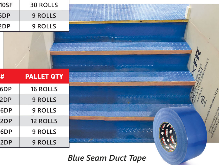
Blue Seam Duct Tape