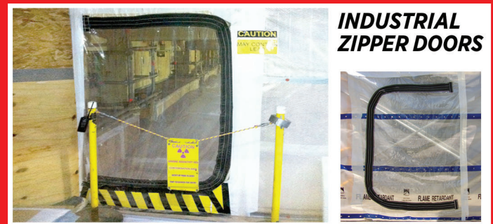
INDUSTRIAL ZIPPER DOORS