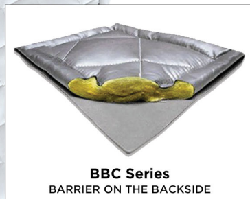
BBC Series BARRIER ON THE BACKSIDE